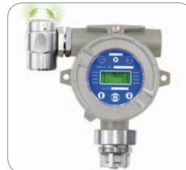
Alarm Beacon Type (Alarm device)