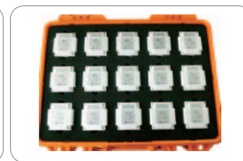
Cartridge Carrying Case